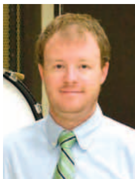
Charles Paxton Professional Excellence Award, School of Education