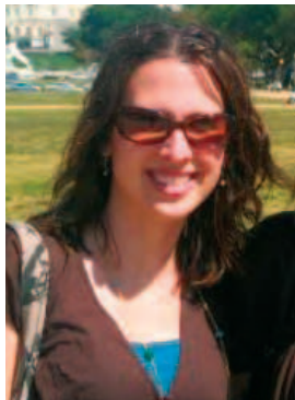
Katie O'Connor Young Leader Award

The following SWU graduates were honored at a recent alumni association banquet.