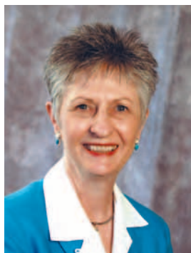
Wanda Whitener Professional Excellence Award, School of Business

Graduating from SWU in 1973 with a degree in business