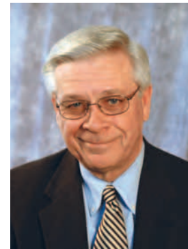
Ken Whitener Professional Excellence Award, School of Business