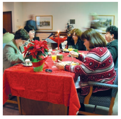
SWU employees get a "thank you" breakfast.

All departments that achieve 100 percent of their members giving to the Promise Fund by November are entered into a drawing for a chance to win a homemade breakfast prepared by the development department to thank SWU employees for their generous support.